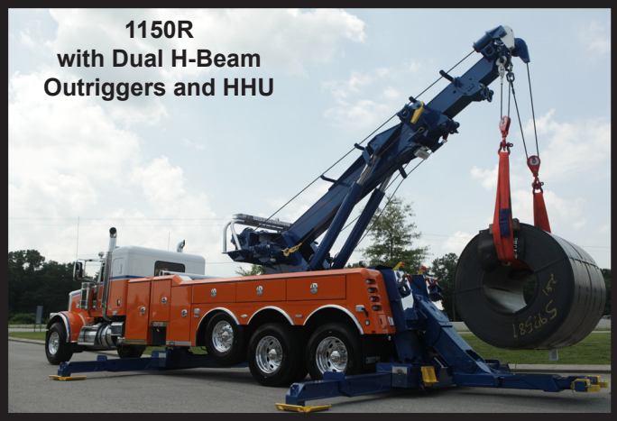
1150R with Dual H-Beam Outriggers and HHU

The patent pending technology on the 1150R allows the boom to travel 60 inches utilizing a self cleaning roller system that requires minimal lubrication. The 1150R has been tested in harsh environments from extreme heat to heavy ice and snow with the proven ability to start and stop under heavy loads. For maximum stability, the 1150R can be ordered with the dual "H" beam outrigger system and HHU underlift.