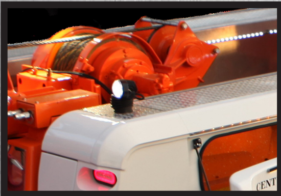
Single 50,000 lb. drag winch is available on the 1150R with 4-stage rear outrigger.