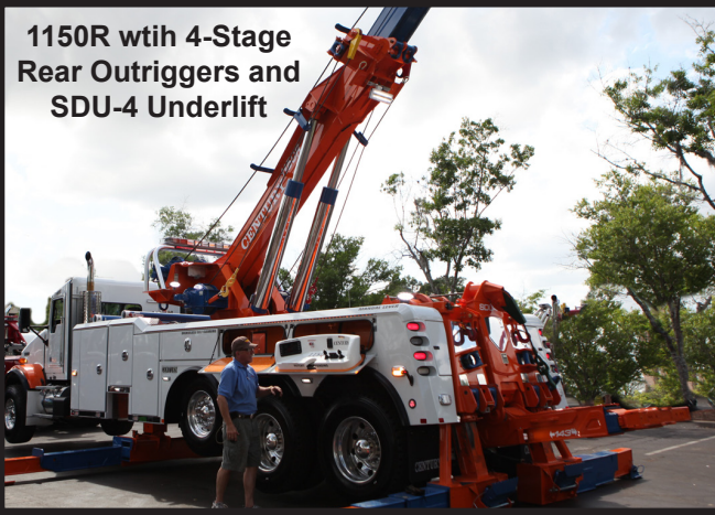
1150R with 4-Stage Rear Outriggers and SDU-4 Underlift

The Century 1150R with 4-stage rear outriggers and the SDU-4 underlift is available with an optional 50,000 lb. drag winch and dual 22,000 lb. turret winches for maximum power and rigging capabilities during those tough recoveries.