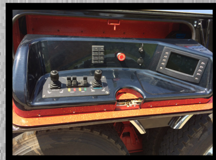
Raptor Control Station

The patent pending Raptor Control Package is standard on the Century 1150R and optional on other rotator models. The operator can easily maneuver through operations at the unit control station or on the wireless remote. Joystick controllers operate boom and winch functions and a display screen offers a variety of information including load sensing and boom positions.