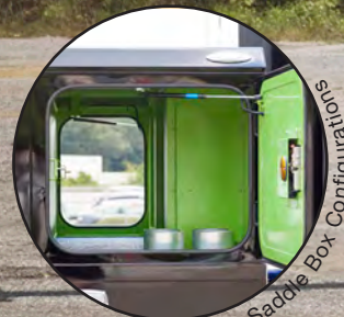
Multiple Saddle Box Configuration