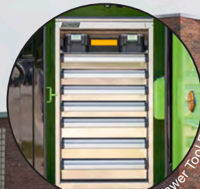
Optional 4 or 7 Drawer Tool Box