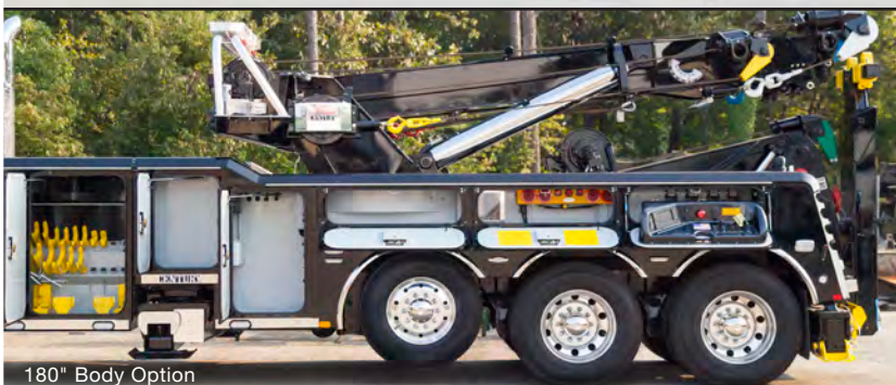
180" Body Option