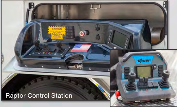
Raptor Control Station

The operator can easily maneuver through operations at the unit control station or on the wireless remote.