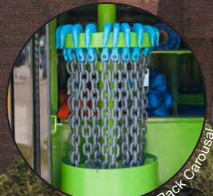
Optional Chain Rack Carousel